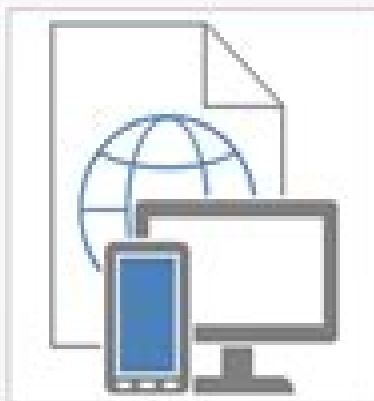
Suivi des biais