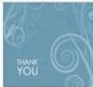
Thank you cards