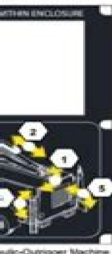
Mast Outrigger Machine