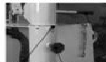
3. Rotate Lockpin 1. Rotate Lock 2. Rotate Handle

1. Mast rotation lock-mechanism. Rotate this knob counter-clockwise to release mast lock prior to rotating.