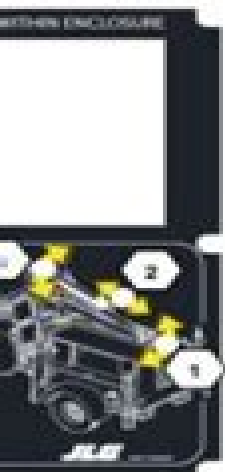
Mast Outrigger Machine