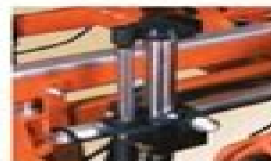
Hydraulic Log Clamp