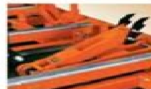
Hydraulic Log Turner