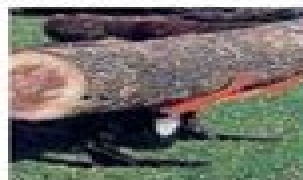
Hydraulic Loading Arms