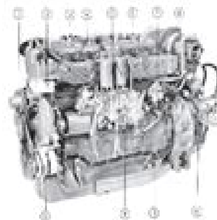
Fig. 4 Engine engine, TAMD60

The fuel system is well protected from interruptions during running by means of an electric, replaceable fuel filter. On the TAMD60 engines the fuel injection pump is large mounted under the other engine from the pump fitted on a bracket.