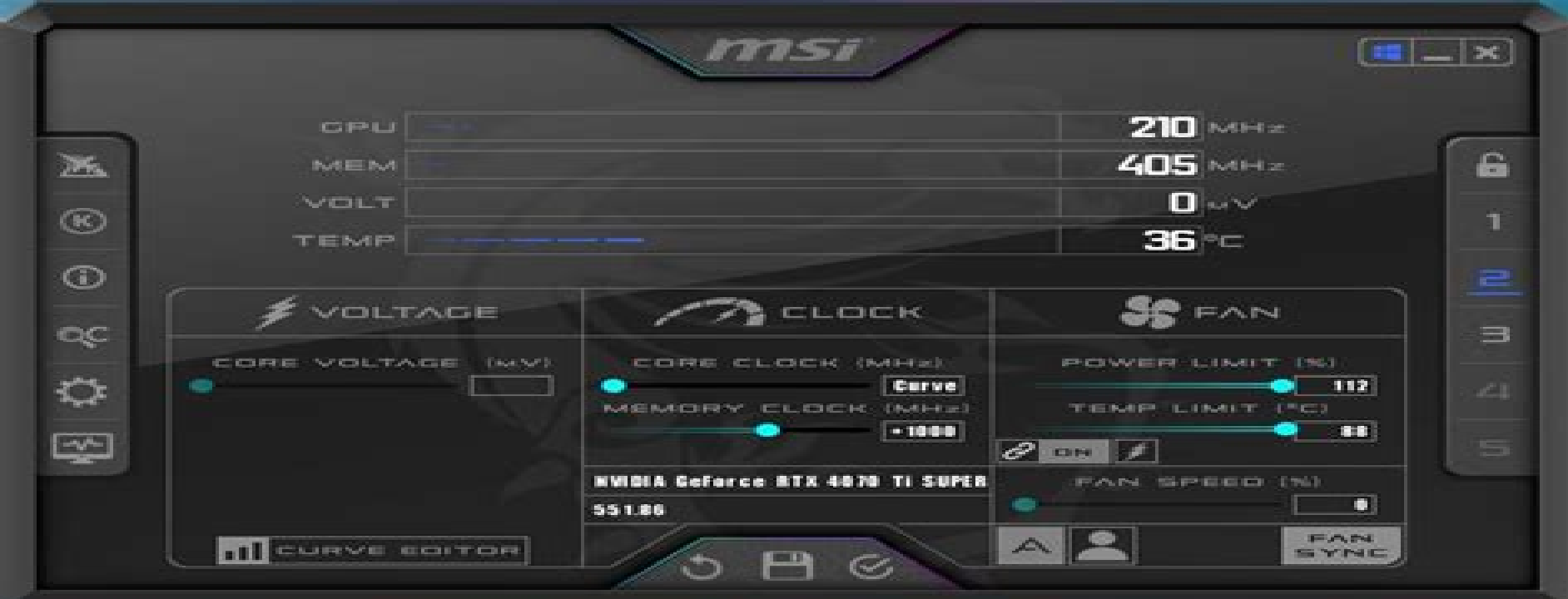
Voltage/Frequency curve editor [0/1]