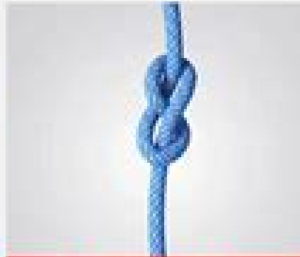
Figure 8 bend