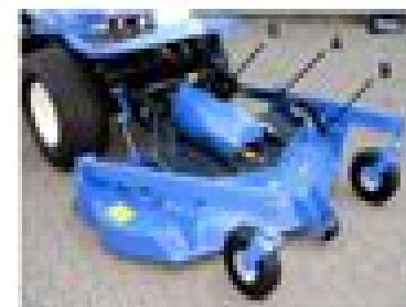
Fig. 1 LIFT arms