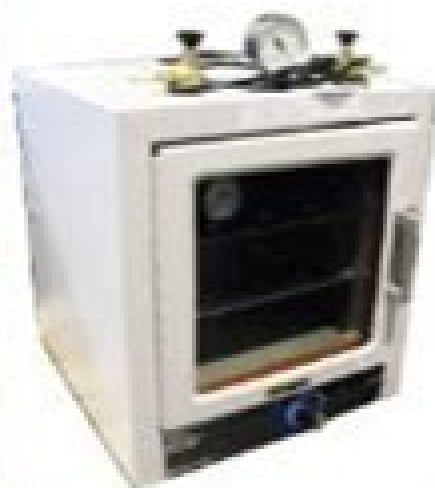
Fisher Scientific Vacuum Oven Model: Isotemp 280A