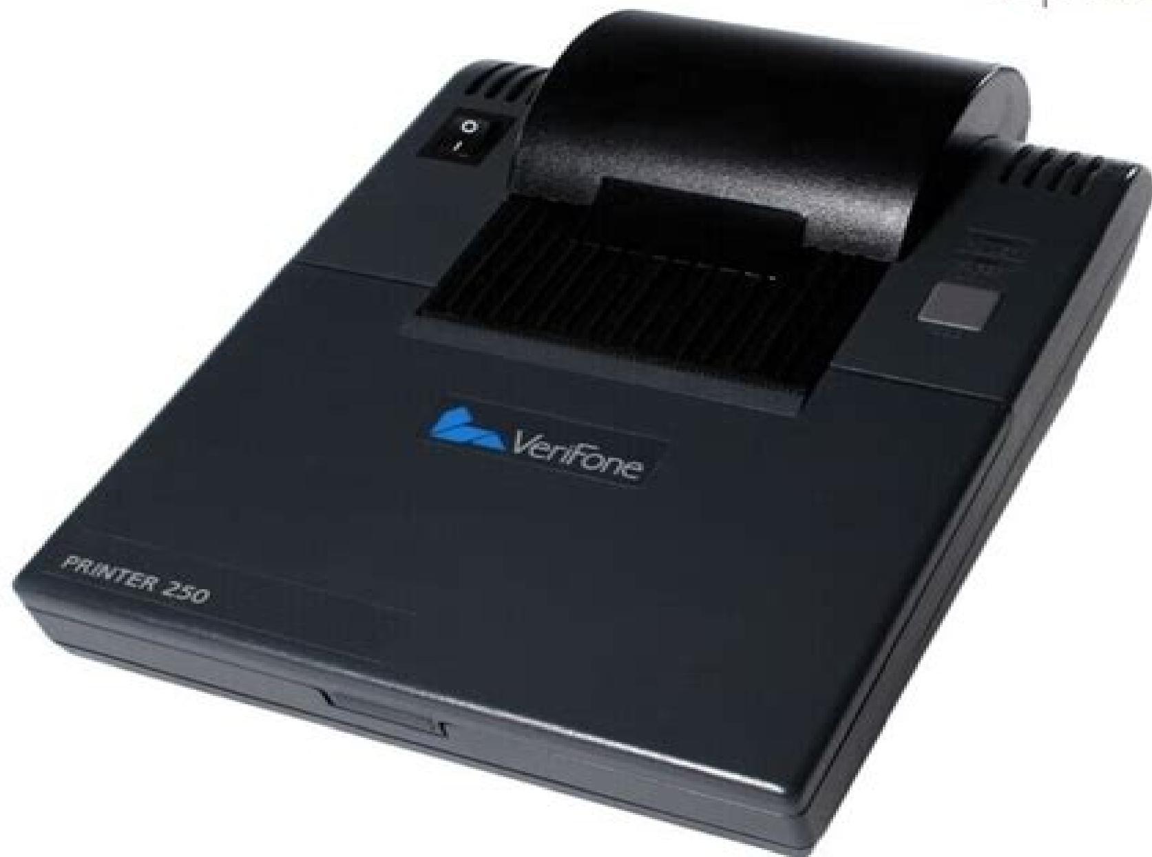
VeriFone Printer 250