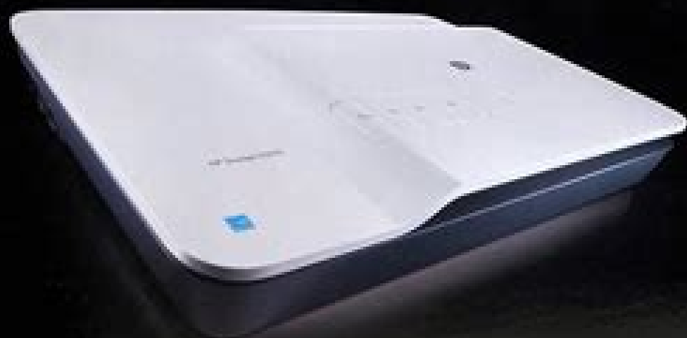
photo scanner scanner photo escáner fotográfico scanner fotográfico