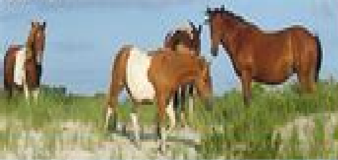
Pony Penning (Following Year)

Frenzy - uncontrolled or wild excitement