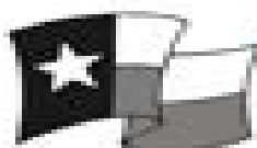
The Angel of Goliad

Each question has four possible answers. Read each one carefully, and choose the one that you think is the best. Then answer the questions that follow.