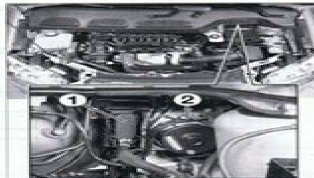
FIG. 7 Situación de los diferentes componentes del sistema ABS en el compartimento motor. - 1. Calculador ABS. - 2. Grupo hidráulico.

Colores: BK. Negro - BN. Marrón - BU. Azul - GN. Verde - GY. Gris - LG. Verde claro - NA. Natural - OG. Naranja - PK. Rosa - RD. Rojo - SR. Plata - VT. Violeta - WH. Blanco - YE. Amarillo.