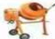
1/2 Bag Mini-mixer