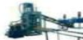
Brick Making Plant