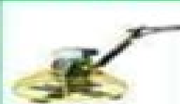
Power Trowel Capacity 3m2/hr Prime Mover - 3hp 5hp motor or 3hp petrol engine