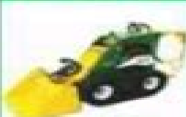
Loader Dumper Capacity 1st 2 Ton Prime mover 10hp 12 hp/Air