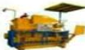
Teg Layer Block Machine