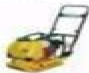
Forward Motion Earth Compactor