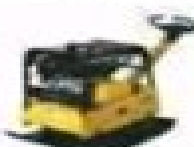
Reversible Motion Earth Compactor