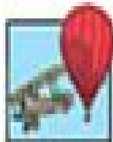
Boy and Girl