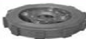
Clutch Plate Assembly