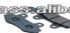
Disc Brake Pads