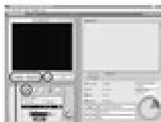
Playback control buttons