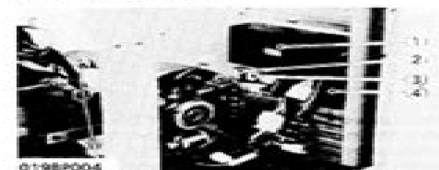
(1) Emergency Unit (3) Safety Relay (2) Change Indicator Unit (4) Regulator