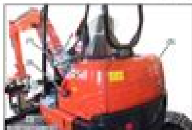
(1) Boom LH (2) Rear boom (3) Fuel tank