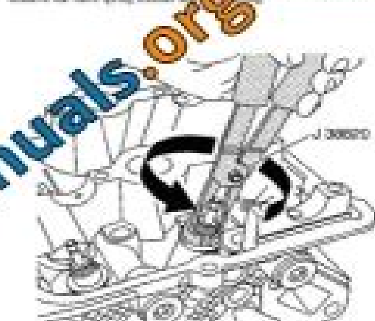
Fig. 100: Using J 38820 To Remove Valve Stem Seal

Remove the valve spring retainers See Special Tools.