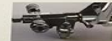
Hardened Stainless Steel Piston Pump — Delivers high-pressure power to spray unthinned paints