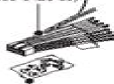
* Screw set (N99-1757-15)