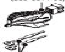
Lever (D10-7012-04) x2