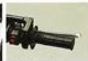
Twist this grip and your goodbyes to competition.

The 1987 KXT250 Tecate. Strictly for riders who are serious about having fun.