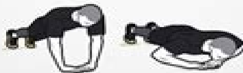
DIAMOND PUSH UPS