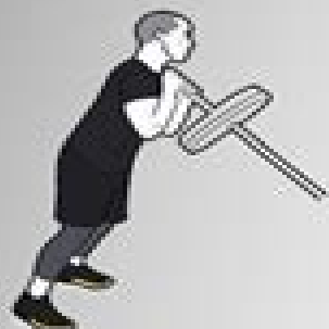
LANDMINE FRONT SQUATS