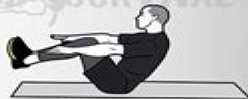
V-SIT KICK OUTS