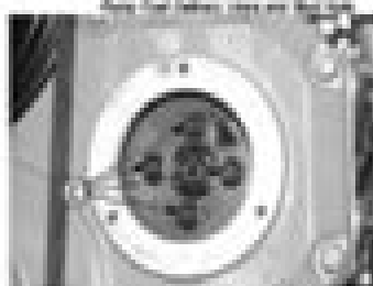
Pump View from the Bore