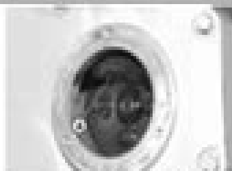
Injection Pump Timing Pin

For injection pump repair and testing, have an authorized diesel injection pump repair station perform the work. Unauthorized repairs made to the injection pump will void warranty.