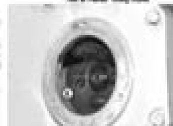
Injection Pump Timing Pin

A—Injection Pump Timing Pin B—Timing Pin