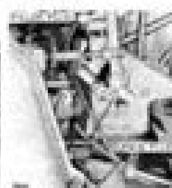
Cranking Engine Transmission Oil Plug