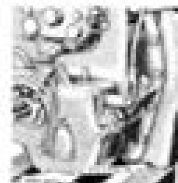
Figure 10-4-9—Power Shaft Clutch Housing Filler Plug

If the tractor is equipped with an engine driven "hot" power shaft, check the oil level in the shaft by inserting the filler plug (Figure 10-4-9). Oil level should be up to level of bottom thread in filler opening. If it is not, add good clean SAE 10-W oil until its level is correct.