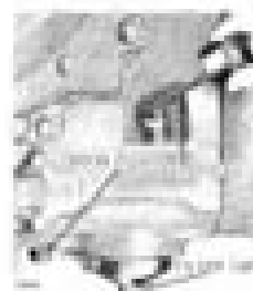
Figure 10-4-2—Adjusting the Oil Level

If oil level is low in either engine, add sufficient good, clean oil to bring the level up to the "full" mark on the dip stick.