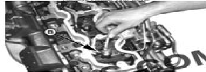
Remove Wires from Injectors