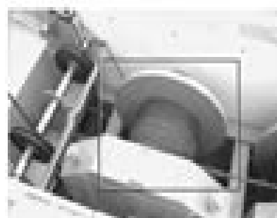
30 Side Support for boom and multiplier of mechanical force. Used with multiplier and boom system to raise and lower boom and to add small crane counterweights.