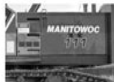
30 Side Support for boom and multiplier of mechanical force. Used with multiplier and boom system to raise and lower boom and to add small crane counterweights.