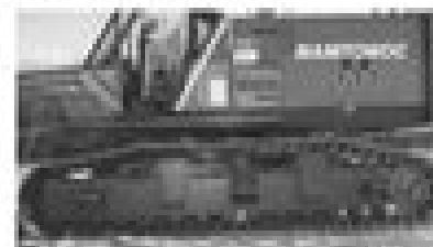
30 Top Support for job