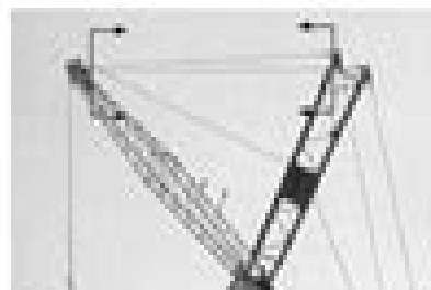
30 Front Support for job