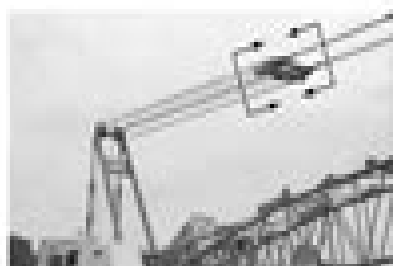
30 Top Support for job