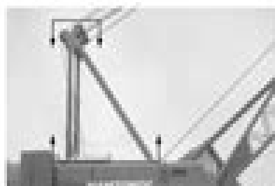
30 Side Support for boom and multiplier of mechanical force. Used with multiplier and boom system to raise and lower boom and to add small crane counterweights.