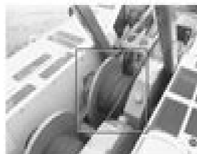
30 Top View to job left or job right