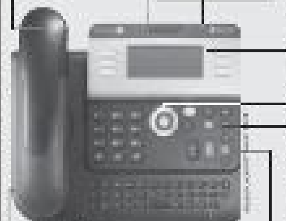
Model AL8201-LUCENT is a Touch 8201 Phone / 4039 Digital Phone