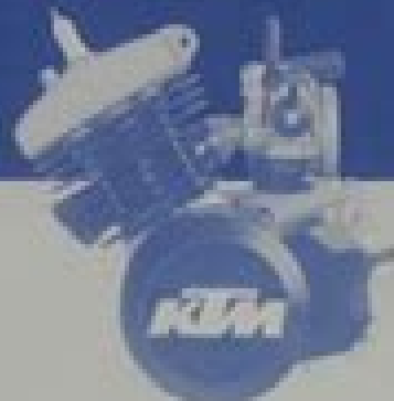
55-E 50 MINI ADVENTURE