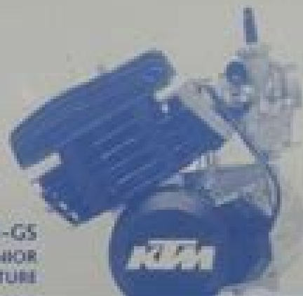
55-GS 50 SX SENIOR 50 SR ADVENTURE