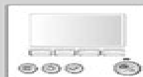
MAIN REMOTE CONTROLLER