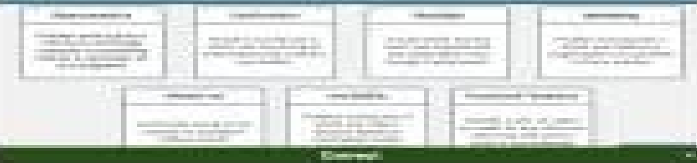
Diagram illustrating the components of a business process model (BPM) and its relationship to a business process (BP).