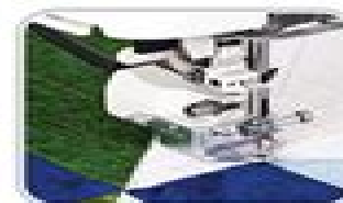
A.S.R. (Accurate Stitch Regulator)