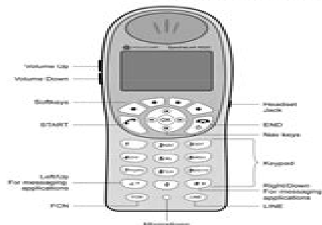
SpectraLink 6020 Wireless Telephone