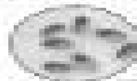
Figure 1: A circular diagram showing the relationship between genetic information and health.

Genetic information is the most important factor in determining an individual's health and well-being. It is the only factor that can be passed on from one generation to the next. Genetic information is the only factor that can be passed on from one generation to the next. Genetic information is the only factor that can be passed on from one generation to the next. Genetic information is the only factor that can be passed on from one generation to the next.