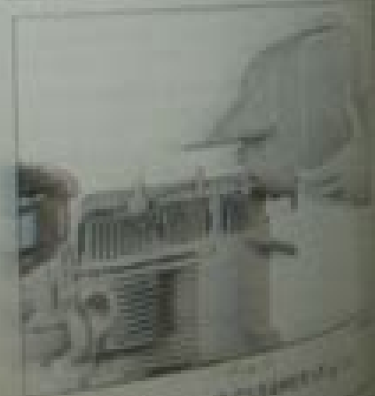
CARBURETOR and AIR CLEANER