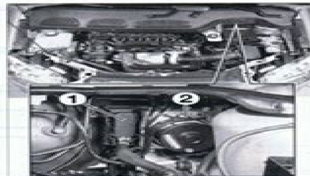
FIG. 7 Situación de los diferentes componentes del sistema ABS en el compartimento motor. - 1. Calculador ABS. - 2. Grupo hidráulico.

Colores: BK. Negro - BN. Marrón - BU. Azul - GN. Verde - GY. Gris - LG. Verde claro - NA. Natural - OG. Naranja - PK. Rosa - RD. Rojo - SR. Plata - VT. Violeta - WH. Blanco - YE. Amarillo.