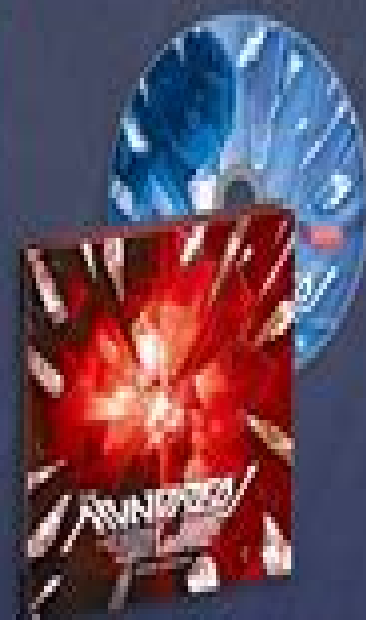
Original Soundtrack CD

Images, Titles, Games. Licensed to and published by XSEED Games. Nintendo Switch is a trademark of Nintendo. The ESRB rating score are registered trademarks of the Entertainment Software Association. Art not final. Items not shown to scale.