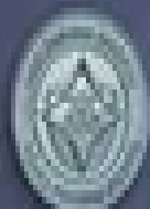
Metal Collector's Pin