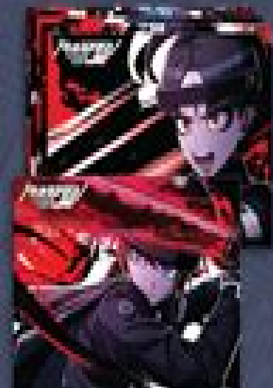
15 Character Art Cards