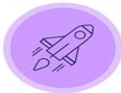
opportunities for promotion