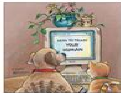
Train Your Human