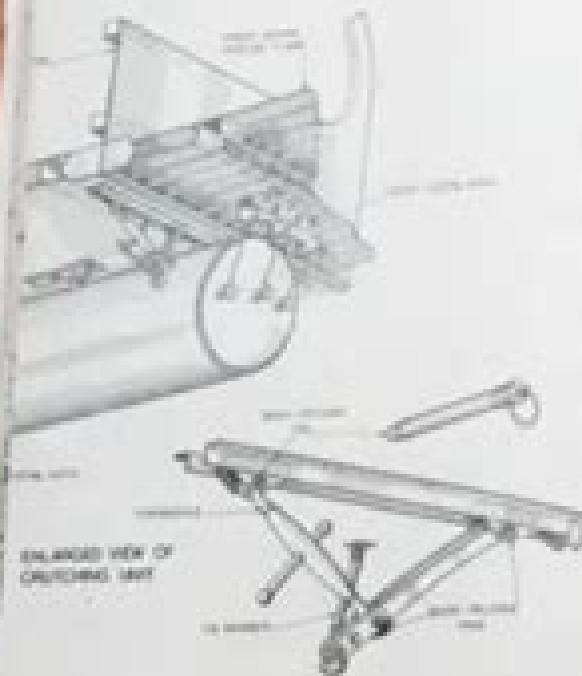
FIG. 14 (PART 2)