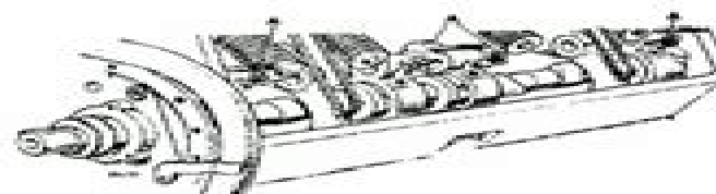
Fig. A-6—Camshaft bearing location bolts