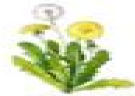
DANDELION Truthfulness, Happiness