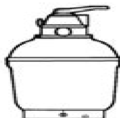
MFM L225, L250 MFM15, MFM17

This step-by-step installation and maintenance guide will provide the necessary information for you to easily maintain the equipment.