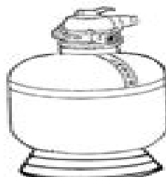
Laser L160, L190