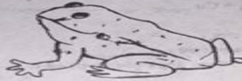
চিত্র : B