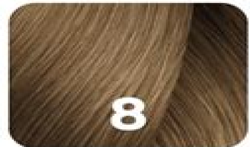
8 Light Blonde