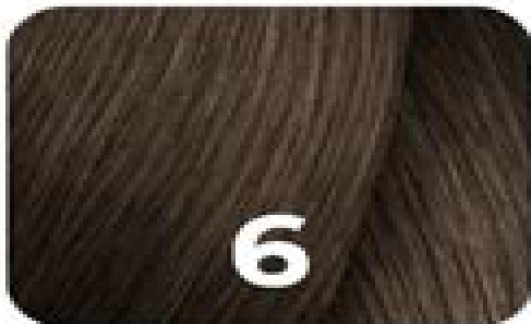
6 Dark Blonde