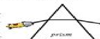
Concave laser lights refract, but don't spread out in a prism.

Lasers give off light of one particular wavelength. This comes from forcing a substance (usually a gas) to give off light. This light bounces back and forth between mirrors, causing other atoms to give off more light. When the light is powerful enough it escapes as a laser beam.