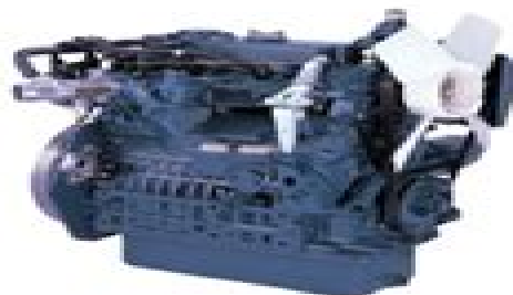
Photograph may show non-standard equipment.