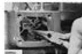
(6) Camshaft gear (7) Camshaft