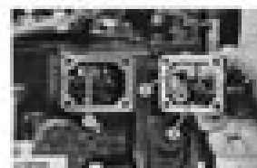
(1) Crankshaft gear (2) Timing belt (3) Camshaft gear